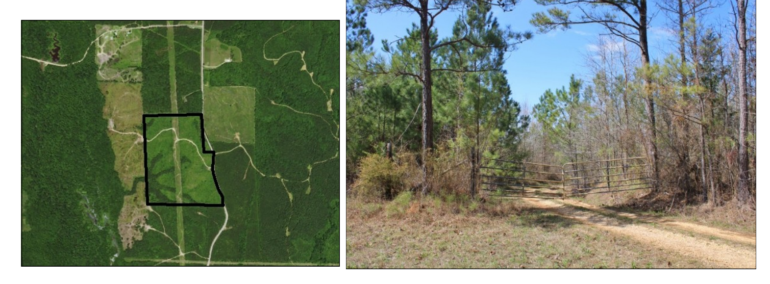
All information furnished is assumed to be accurate and correct. However, neither the property owner nor Midsouth Forestry Services warrant the accuracy of information furnished. Prospective buyers should satisfy themselves as to the accuracy of this information. No representation or warranties are expressed or implied as to the property, its condition, boundaries, access, acres, zoning, condition of title or fair market value.