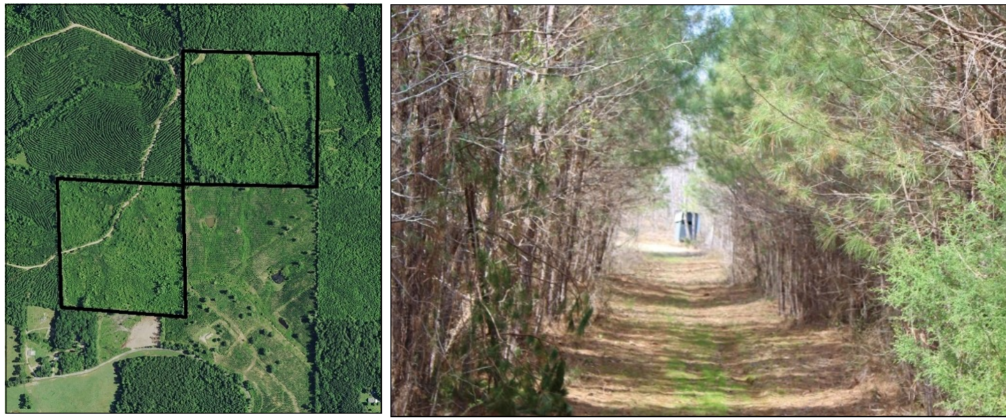
All information furnished is assumed to be accurate and correct. However, neither the property owner nor Midsouth Forestry Services warrant the accuracy of information furnished. Prospective buyers should satisfy themselves as to the accuracy of this information. No representation or warranties are expressed or implied as to the property, its condition, boundaries, access, acres, zoning, condition of title or fair market value.

This +/- 75.2 acre tract is located off of paved County Road 160—less than 5 miles from Winfield, AL and 6 miles from Brilliant, AL. The tract contains naturally regenerated pine and hardwoods. With good interior roads and containing 2 established wildlife food plots, this tract is ready to hunt!