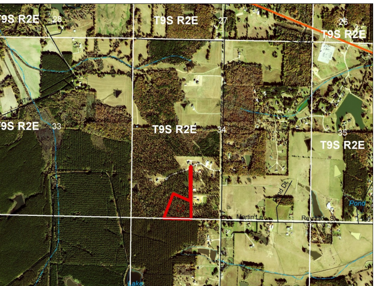
All information furnished is assumed to be accurate and correct. However, neither the property owner nor Midsouth Forestry Services warrant the accuracy of information furnished. Prospective buyers should satisfy themselves as to the accuracy of this information. No representation or warranties are expressed or implied as to the property, its condition, boundaries, access, acres, zoning, condition of title or fair market value.