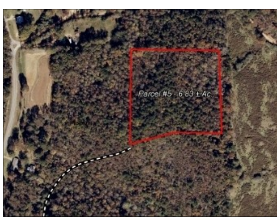
All information furnished is assumed to be accurate and correct. However, neither the property owner nor Midsouth Forestry Services warrant the accuracy of information furnished. Prospective buyers should satisfy themselves as to the accuracy of this information. No representation or warranties are expressed or implied as to the property, its condition, boundaries, access, acres, zoning, condition of title or fair market value.