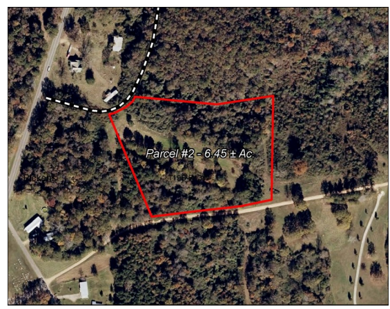
All information furnished is assumed to be accurate and correct. However, neither the property owner nor Midsouth Forestry Services warrant the accuracy of information furnished. Prospective buyers should satisfy themselves as to the accuracy of this information. No representation or warranties are expressed or implied as to the property, its condition, boundaries, access, acres, zoning, condition of title or fair market value.