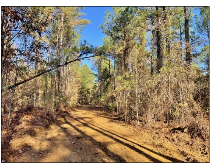
All information furnished is assumed to be accurate and correct. However, neither the property owner nor Midsouth Forestry Services warrant the accuracy of information furnished. Prospective buyers should satisfy themselves as to the accuracy of this information. No representation or warranties are expressed or implied as to the property, its condition, boundaries, access, acres, zoning, condition of title or fair market value.