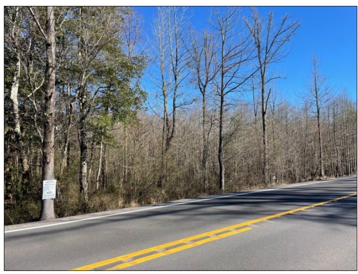
All information furnished is assumed to be accurate and correct. However, neither the property owner nor Midsouth Forestry Services warrant the accuracy of information furnished. Prospective buyers should satisfy themselves as to the accuracy of this information. No representation or warranties are expressed or implied as to the property, its condition, boundaries, access, acres, zoning, condition of title or fair market value.