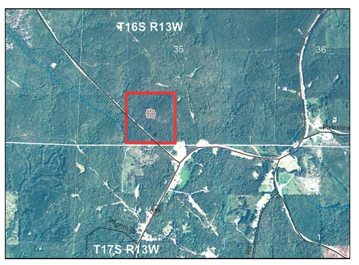
All information furnished is assumed to be accurate and correct. However, neither the property owner nor Midsouth Forestry Services warrant the accuracy of information furnished. Prospective buyers should satisfy themselves as to the accuracy of this information. No representation or warranties are expressed or implied as to the property, its condition, boundaries, access, acres, zoning, condition of title or fair market value.